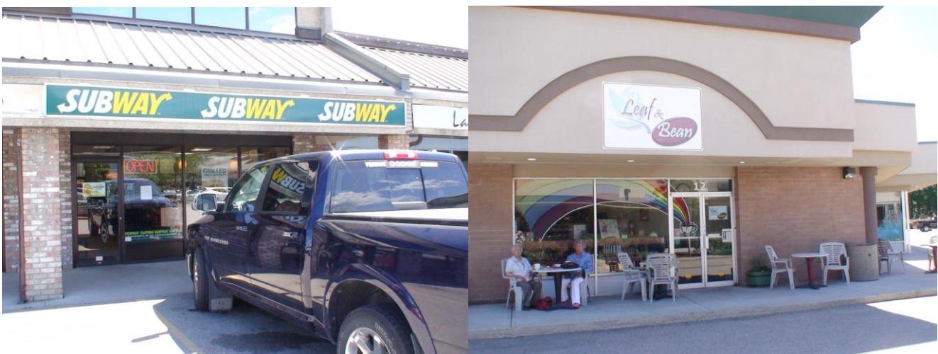
Subway (250 546 6362) 3300 Smith Dr.