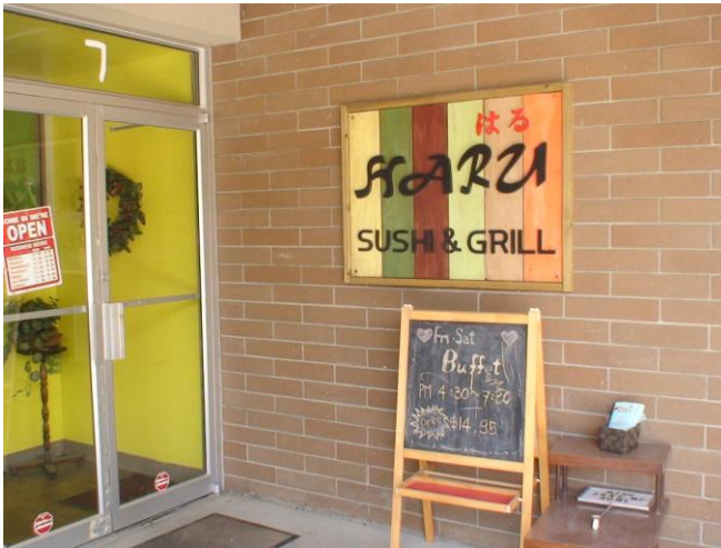
Harzi Sushi 3305 Smith Dr