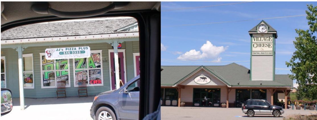
JJ's Pizza Plus (250 546 3333) 3495 Pleasant Valley Rd.