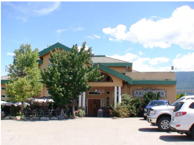
Anchor Inn (250 546 8010) 3030 Smith Dr