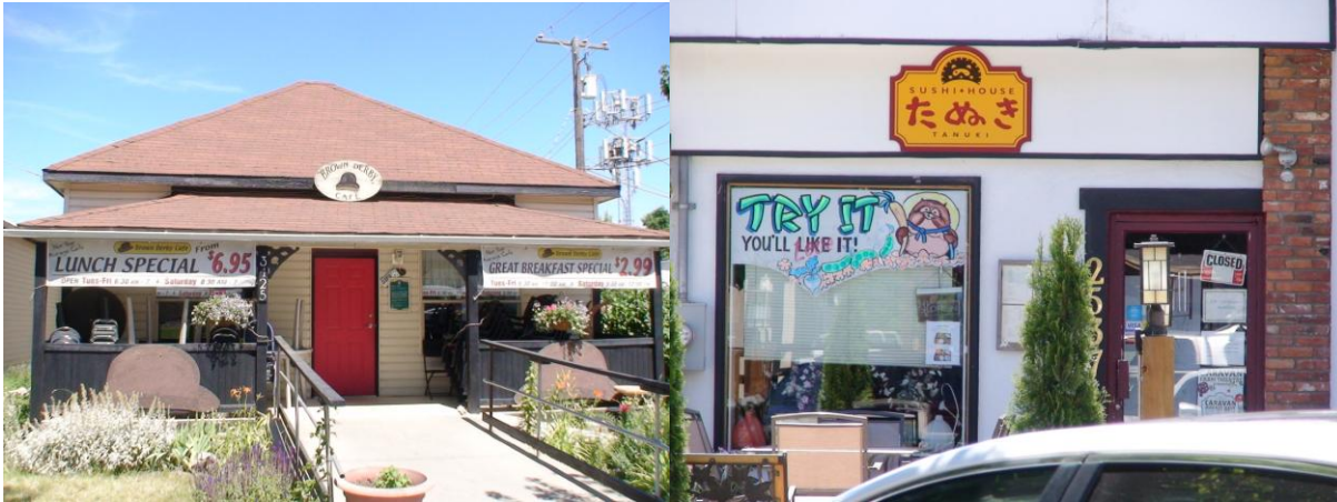
Brown Derby (250 5468221) 3425 Pleasant Valley Rd. Tanuki Sushi House (250 546 0090) 2537 Pleasant Valley Rd.