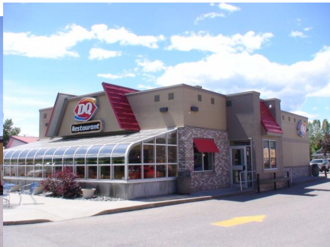
DQ 3110 Smith Dr