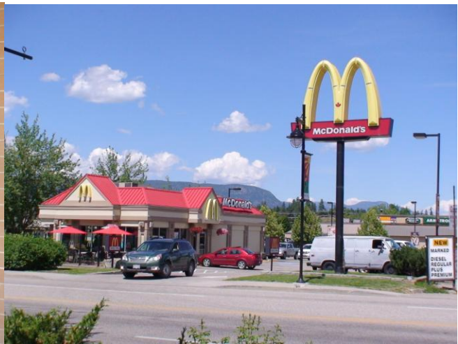
McDonalds 3240 Smith Dr