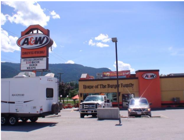
A&W 3130 Smith Dr