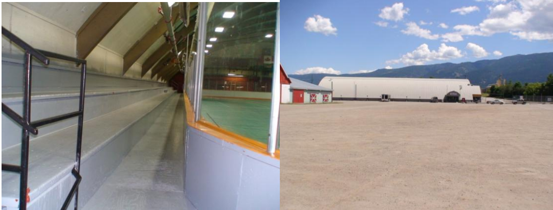
Concession on shooting level and seating to watch the competition. Ample parking