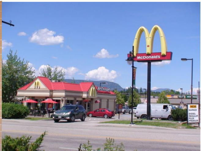
McDonalds 3240 Smith Dr