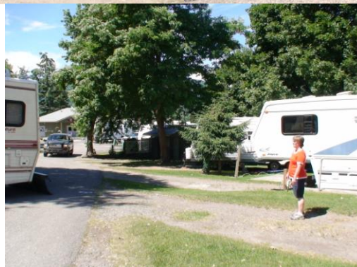
Camping hook ups at Fair Grounds 3315 Pleasant Valley Rd. and next door at Kim RV Park (250 546 4041) 3311 Park Dr. Armstrong