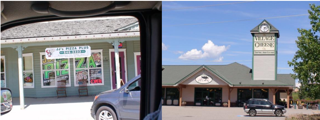
JJ's Pizza Plus (250 546 3333) 3495 Pleasant Valley Rd.