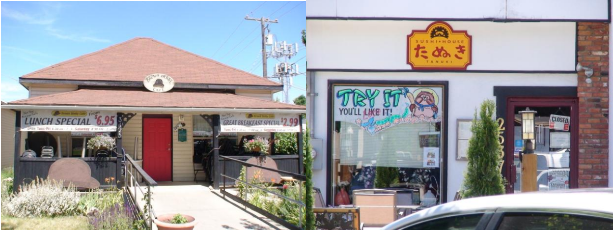
Brown Derby (250 5468221) 3425 Pleasant Valley Rd. Tanuki Sushi House (250 546 0090) 2537 Pleasant Valley Rd.