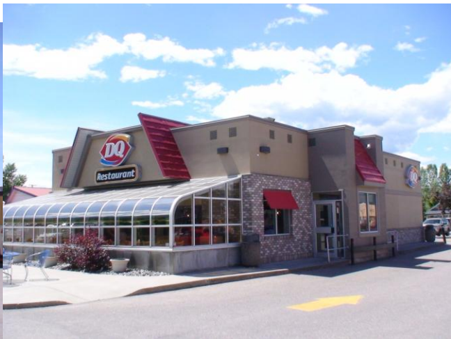
DQ 3110 Smith Dr