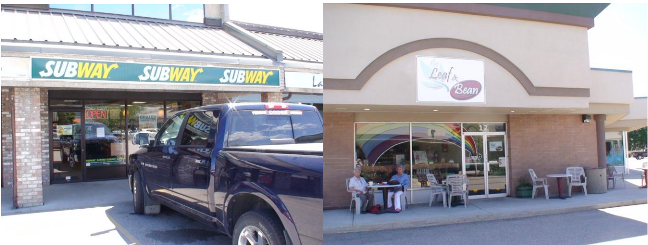
Subway (250 546 6362) 3300 Smith Dr.