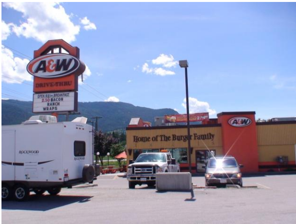
A&W 3130 Smith Dr